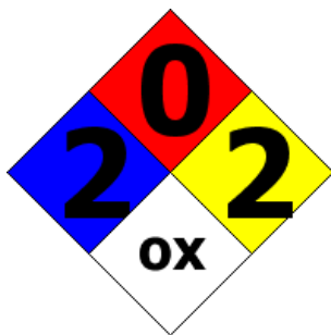
NFPA SCALE (0-4)